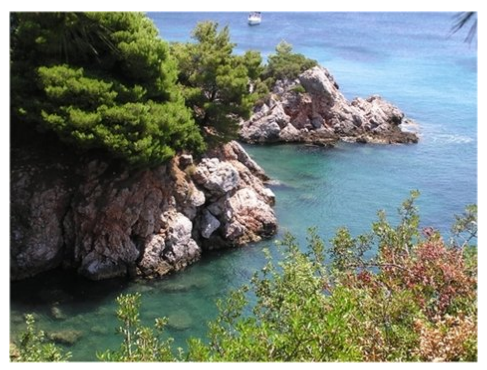
Figure 6. The National Marine Park of Northern Sporades (Alonissos) was the first to be established in 1992. It is the breading ground for the dwindling population of monk seals

Vikos-Aoös National Park: Located in the north-west (Epirus), it is the largest park in the country and covers an area of 12000 hectares, 3400 of which are designated wilderness. Pindos National Park (Valia Calda): a 7,000 ha area of untouched forest. It harbours many endangered raptor species as well as some of the country's last brown bear and wolf populations. Sounio National Park on the south-eastern tip of Attica, about 50 km south-east of Athens,. Samariá National Park: the most visited of the national parks in Greece, located in the White Mountains of south-western Crete, Prespes National Park: the most important wetlands in the Balkans and the only transnational park. It surrounds the Greek side of the two Prespes lakes (Mikrí Prespa and Megáli Prespa) in western Macedonia. Parnassos National Park: in south-central mainland Greece. Second-largest of the parks, this is a wilderness in the area near Delphi. Olympus National Park: oldest of the country's parks, founded in 1938. The 4,000 ha of this park in southern Macedonia include the summit of Mount Olympus. Oiti National Park: south-eastern mainland Greece. Its 3,010 ha of core area and 4,200 ha peripheral zone cover more diverse terrain than most other parks. Parnitha National Park: is close to Athens and is the most visited park Ainos National Park: national parks that's on an island. Ainos is a forested mountain on Cephalonia, largest of the Ionian Islands. Much of it is covered with an endemic species of fir.