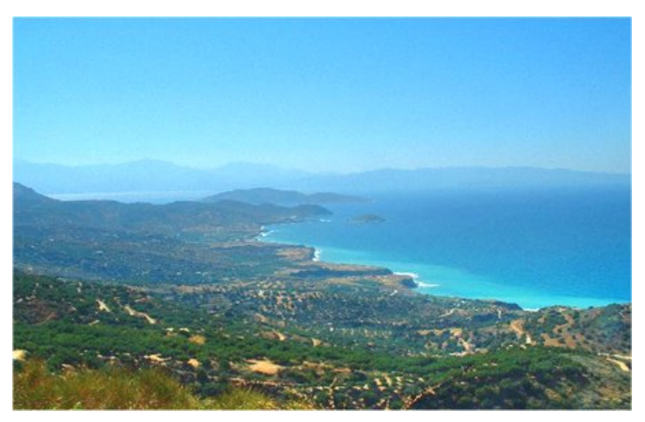
Figure 2. Greece's coastline is extremely beautiful but also very fragile to environmental pressures, erosion and expansive tourism.

The Saronikos Gulf has been the centre for research and monitoring for many years because of the untreated sewage pollution discharged from the metropolitan Athens and Piraeus areas and the shipping pollution of the port. Before, the effect of sewage effluent (calculated at 600-750,000 m<sup>3</sup> per day) on the benthos of the Saronikos was catastrophic from pollutants, such as hydrocarbons, sediments, heavy metals and PAHs. The most vulnerable area is the Elefsis Bay and other areas near and around the port of Piraeus. When finally the Psyttalia wastewater treatment plant (1994-1999 with biological treatment plant) started operating the situation in the Gulf changed and the conditions have improved substantially (Makra et al. 2001; Scoullos et al. 2007; Vlahogianni et al. 2007; Vlahogianni et al. 2007; Vlahogianni et al. 2007; Vlahogianni et al. 2007; Vlahogianni et al. 2008).