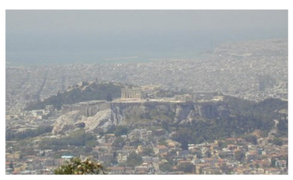
Figure 4. Atmospheric pollution in Athens ( "nephos", hazy atmosphere in the center of the city ) was persistent for many years. But changes in fuel quality and restrictions in automobile traffic improvent substantially the situation.

measures to protect one of Europe's most important wetlands. The case relates to the pollution and degradation of Lake Koronia in the region of Thessaloniki. Greece is being sent a second and final written warning for failing to implement the necessary legal protection and conservation framework for the site (European Commission 2010)