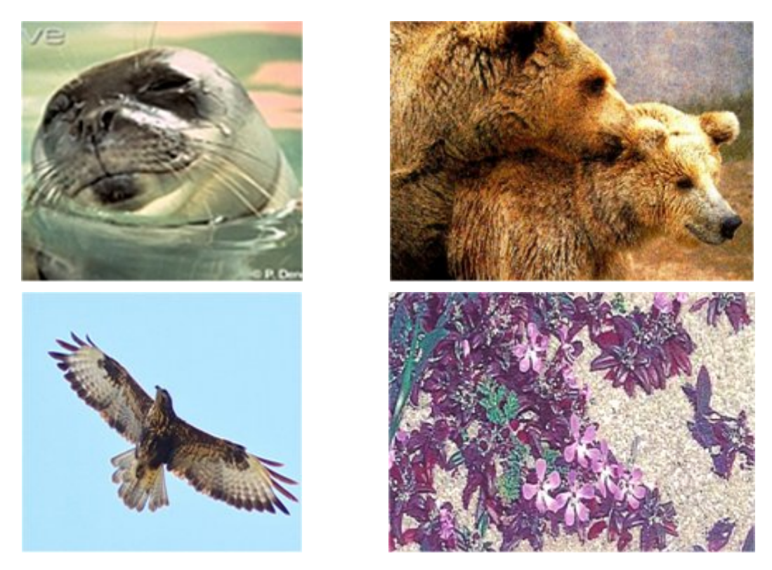
Figure 7. Endangered species in Greece. The Mediterranean monk seal, the brown bear, Buteo buteo (Common buzzard, Gerakina in Greek) and Saponaria jagelii (Greek islands) critically endangered plant.