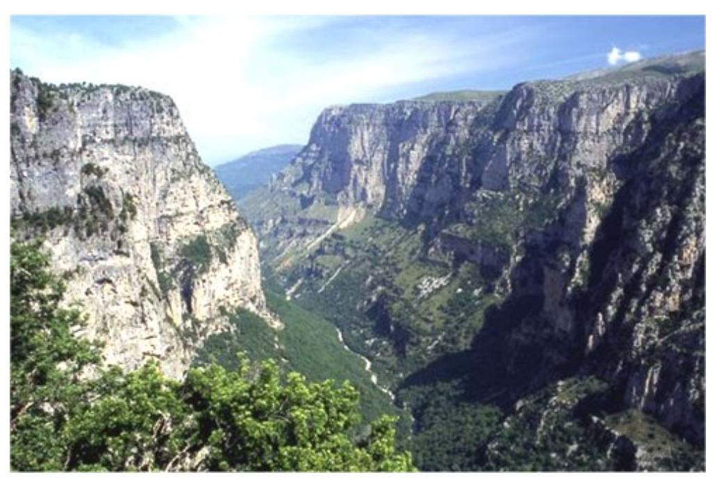
Figure 5. The Vikos-Aoos National Park in Epirus is one of the most beautiful and spectacular ecosystem and park in Greece.

Patras (the third largest city) with two monitoring stations showed increased levels of NO<sub>2</sub> and PM<sub>10</sub> with exceedances in winder months due to increased traffic in the centre. Periodical monitoring in other big cities (Larissa, Volos, Heraklion, Kozani, Chania, Ioannina, Kavala, Rodos and Mytilini) showed that air pollution in the city center consists of low levels air pollutants, except for suspended PM<sub>10</sub> due to increased car traffic. Air pollution monitoring in the most important electric power stations in Kozani, Ptolemaida and Megalopolis (Peloponnesos), which use as a fuel lignite and petrol, showed increased levels of SO<sub>2</sub> and PM<sub>10</sub>. (National Center of the Environment and Sustainable Development 2008).