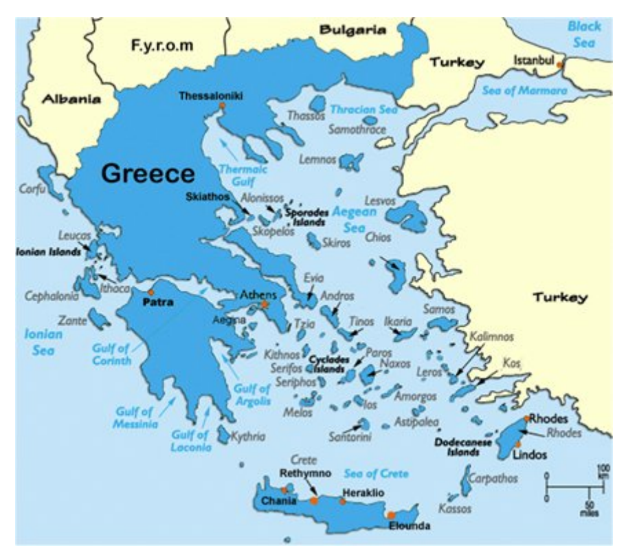
Figure 1. Map of Greece. Greece has around 3,000 islands and 18,000 km of coastline. Its mainland is 80% mountainous.

Marine life is also exceptionally varied with some rare and endemic species. More than 75% of the population live in urban areas. Athens and the surrounding urban area has a population 4.5 million and Thessaloniki city in the north with 1 million population. Piraeus is the biggest and most busy port in the country (20 million passengers and 1.5 million containers per year). Recently, there is a decreasing trend of the annual and seasonal levels of precipitation, especially the summer precipitation which is projected to decrease for the Mediterranean region. These trends are expected to affect fauna and flora, biodiversity, water resources, forest fires and various sensitive ecosystems.